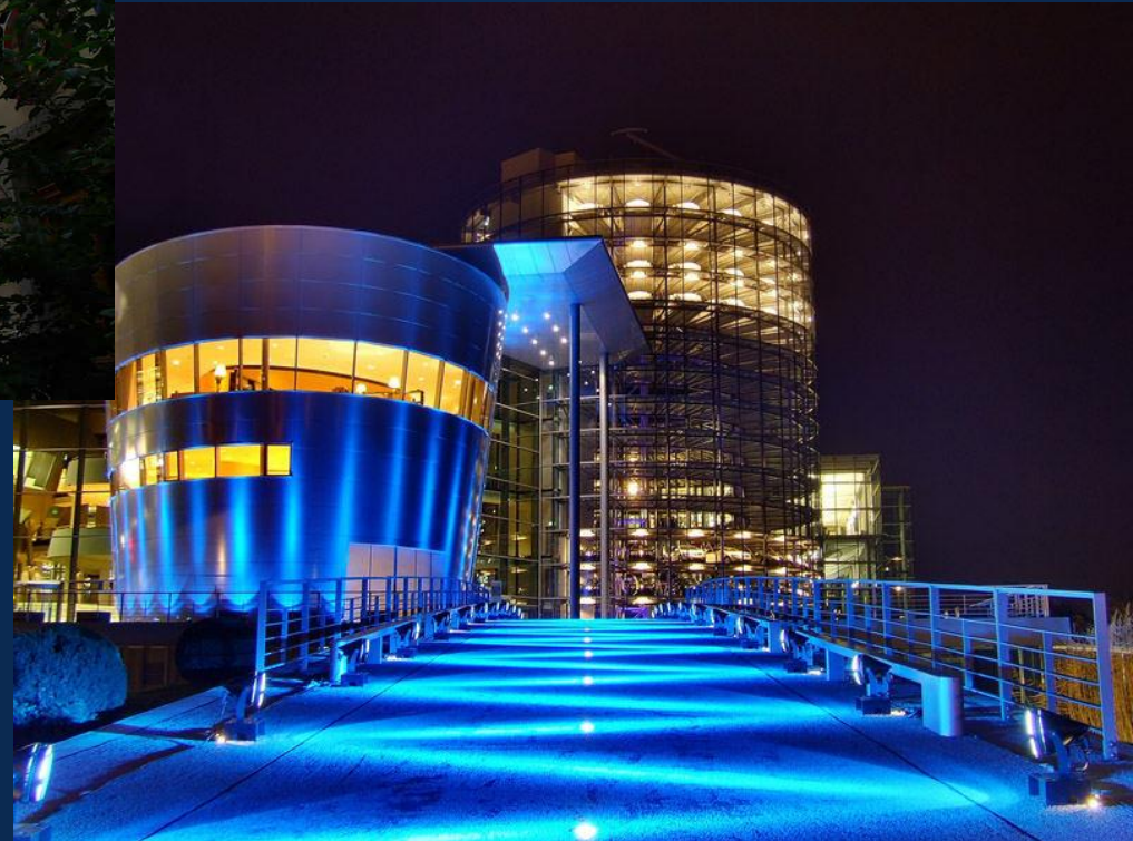
Stylish car manufacturer