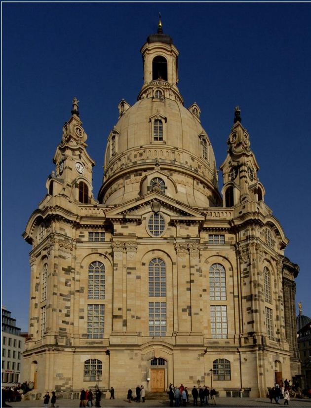
Church of our ladies