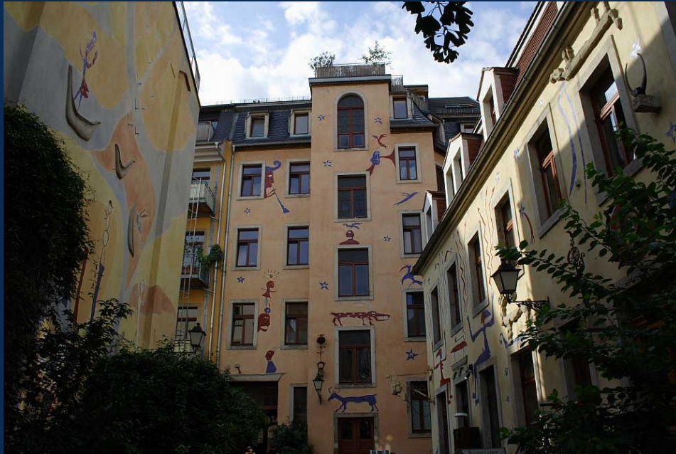
Student's quarter (downtown)